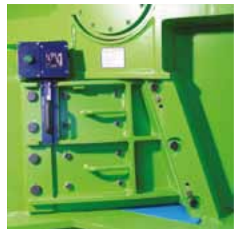
Lid for stator knife change