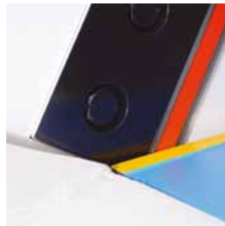
Chipping knife and counter-knife