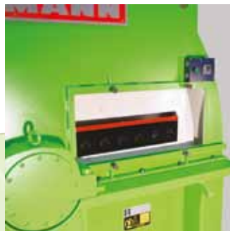
Lid for chipper knife change